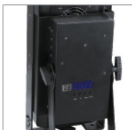
IP20 display device