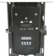
IP44 display device